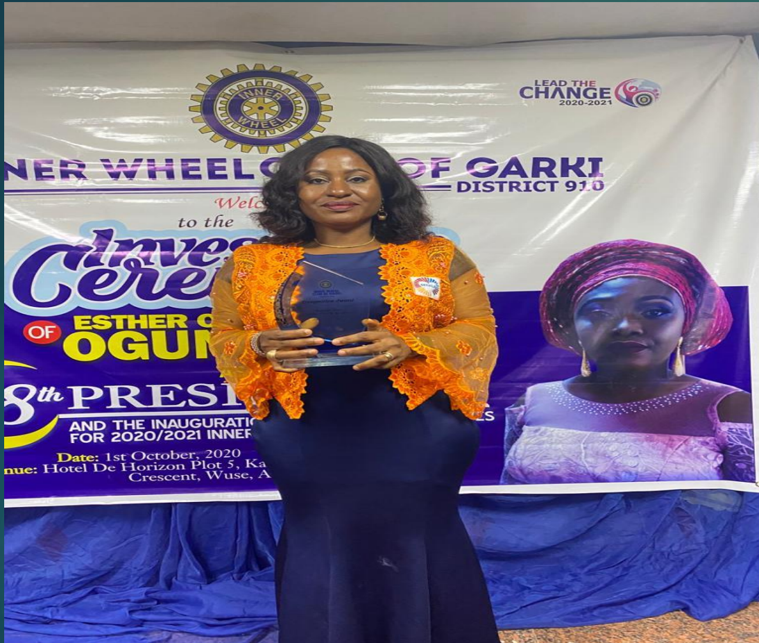
Award for Distinguished Humanitarian Service by Inner Wheel Club Garki