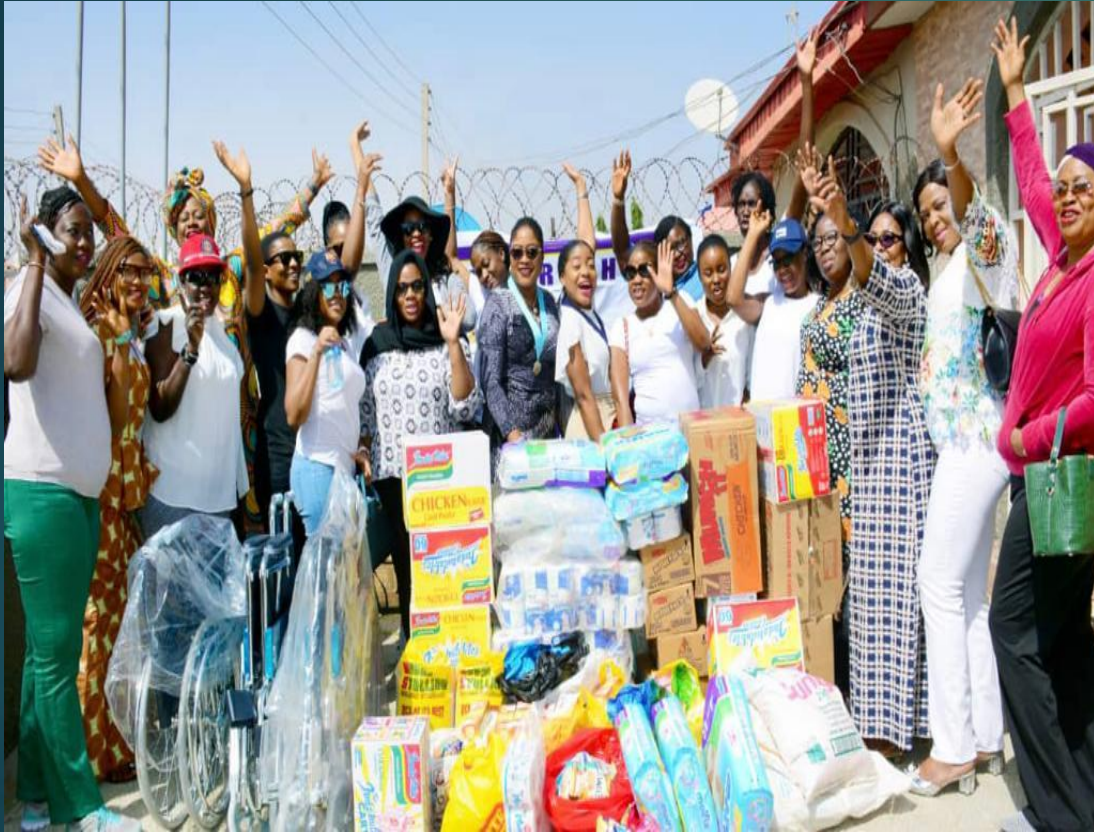
Inner Wheel Club Garki District