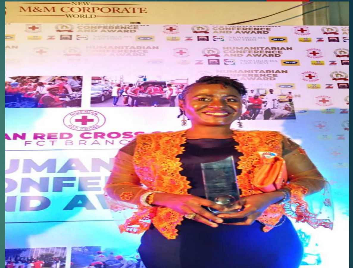
Award for Distinguished Humanitarian Service by International Red Cross