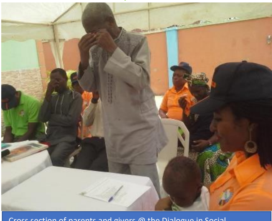
Cross section of parents and givers @ the Dialogue in Social Acceptance of CP

1. Advocacy And Research for Children With Disabilities/Persons