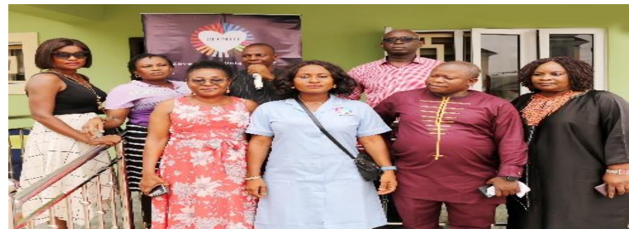
The Chairperson Trustees, President, Co Founder, Trustees and Friends of