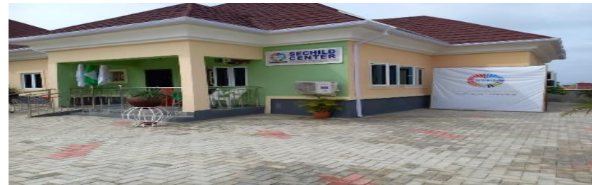
The Expanded Center

She called for more partnership to be able to purchase a generating Set and a vehicle for SECHILD Center.