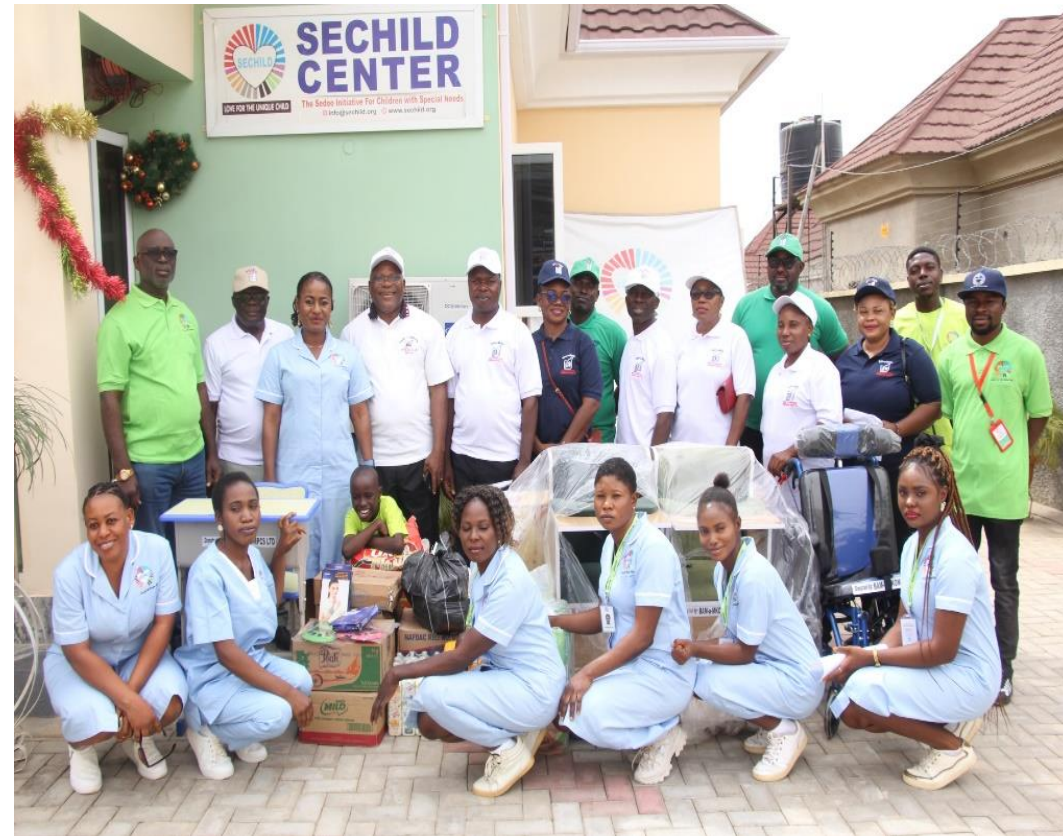
The President and members of BAM U Mkom MPCs supports SECHILD

In the year 2023, SECHILD we will also focus on securing long term funding for the project. Funding that is secured for multiple years will aid us in planning for the future, expanding our services, and ensure our ability to grow our staff. Finally, we would continue to broaden our horizon, expand our networks and amplify the advocacy for access to improved health, education and developmental opportunities.