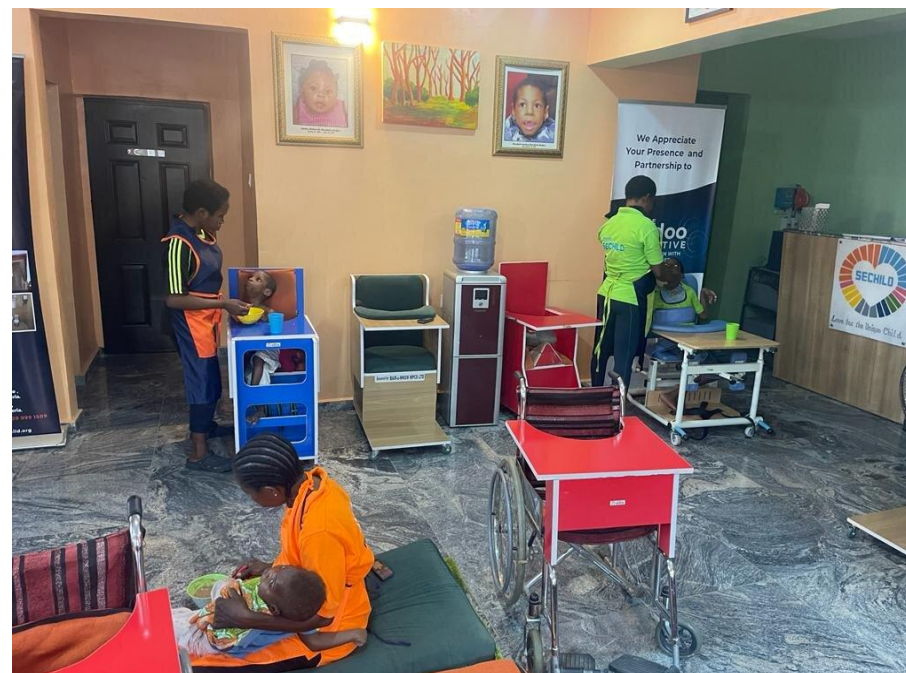
Feeding at SECHILD Center

SECHILD provides residence care, respite and therapy to improve the conditions of children with Cerebral Palsy. We incorporate play and art therapy through art and music, physio/occupational therapy, expressive therapy for physical, psychological and mental health support to improve the quality of life of the children and their families. In the year under review, 100 children benefitted from these therapies aiding to develop their physical abilities, cognitive functioning levels and emotional needs in a safe and supportive environment.