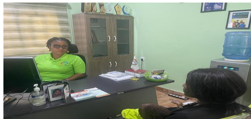
The President counselling and training a parent on management of Cerebral Palsy