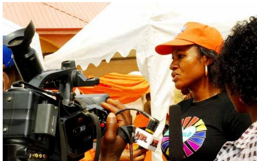
Media Advocacy for increased budget to support basic education for children

The project aims to advocate for increased public budget allocation to Primary education for children with disabilities. Primary education is critical to the development of any child, it lays the foundation for the advancement of any child.