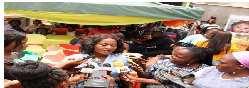
The President engaging Media at the Launch