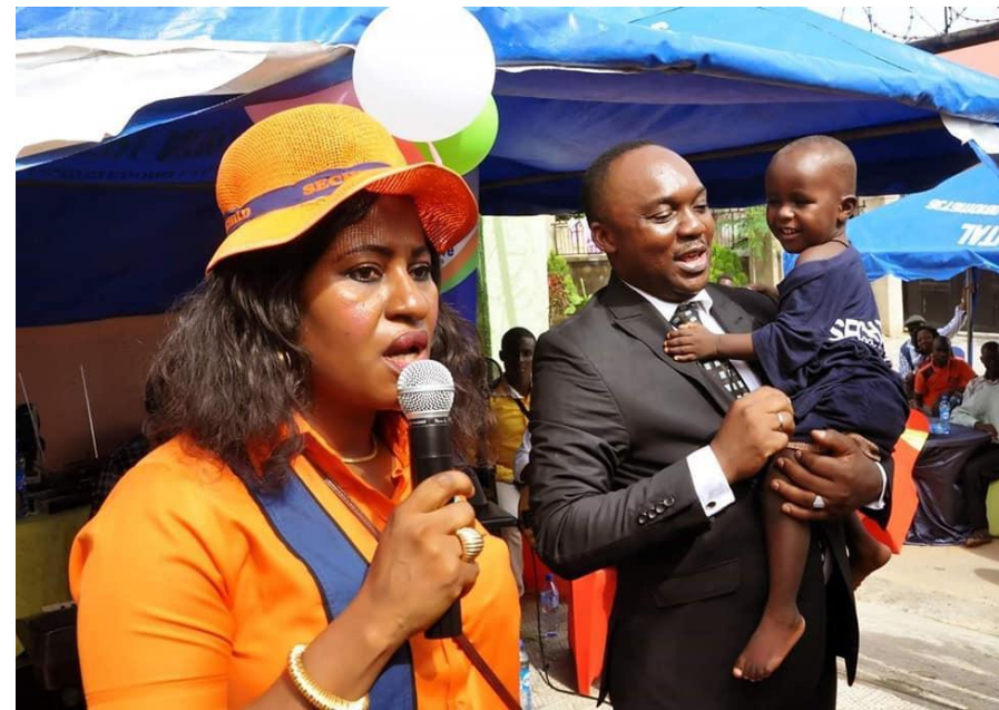
The President addressing Parents at the 2022 Parents forum

Under The Self-Care//Therapy for Caregivers and Parents of Children with Special Needs, Parents Forum was organised with 25 parents and 35 caregivers to train and educate them on self-care as well as care of their wards. Their capacities were enhanced on understanding the rudiments of Cerebral Palsy. They were empowered to speak up, manage expectations, discrimination and educate other people on the condition of their children. They were equally counselled by pro-bono psychologist.